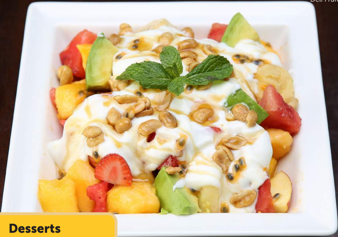
Deli Fruit Salad

Escape to paradise with our Tropical Bliss Salad 550