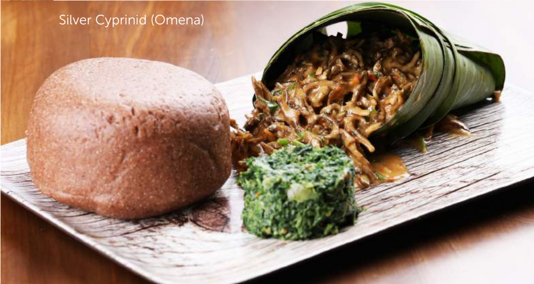
Silver Cyprinid (Omena)