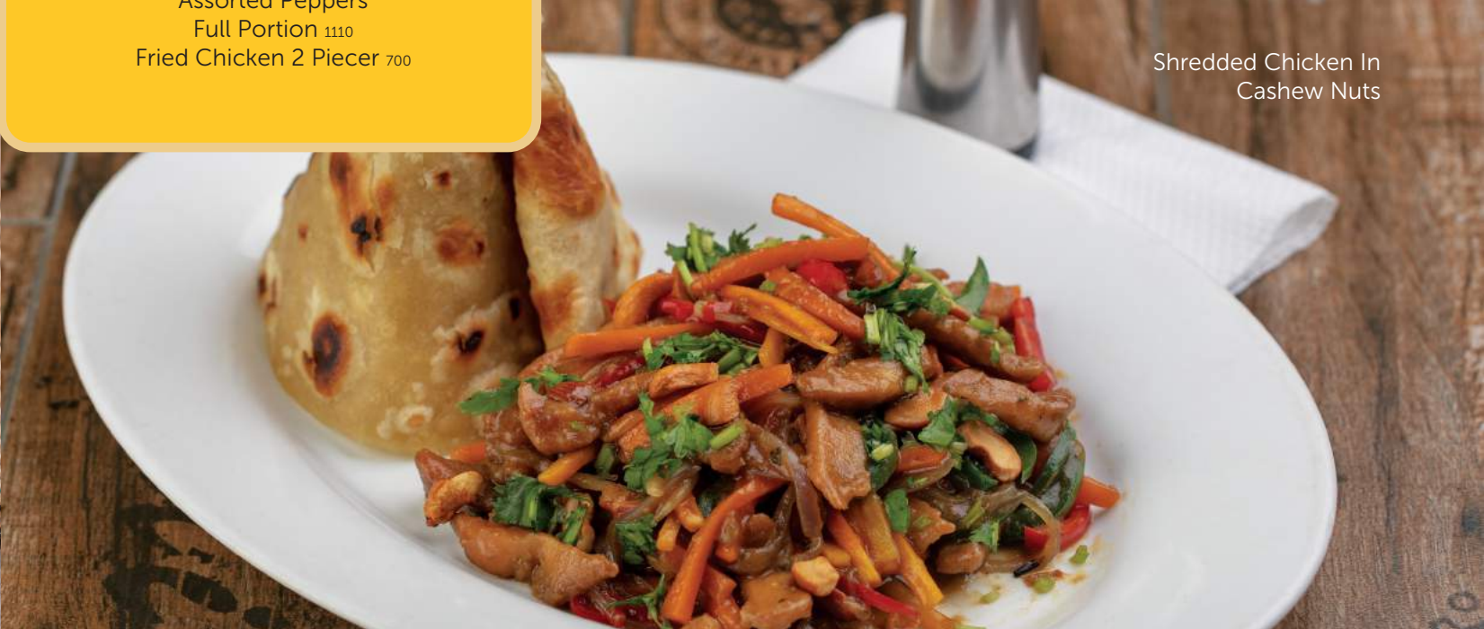
Shredded Chicken In Cashew Nuts

All Meals Served with either Home Fries, Mashed Potatoes, Chips, Rice, White Ugali, White or Brown Chapati or Garden Salad