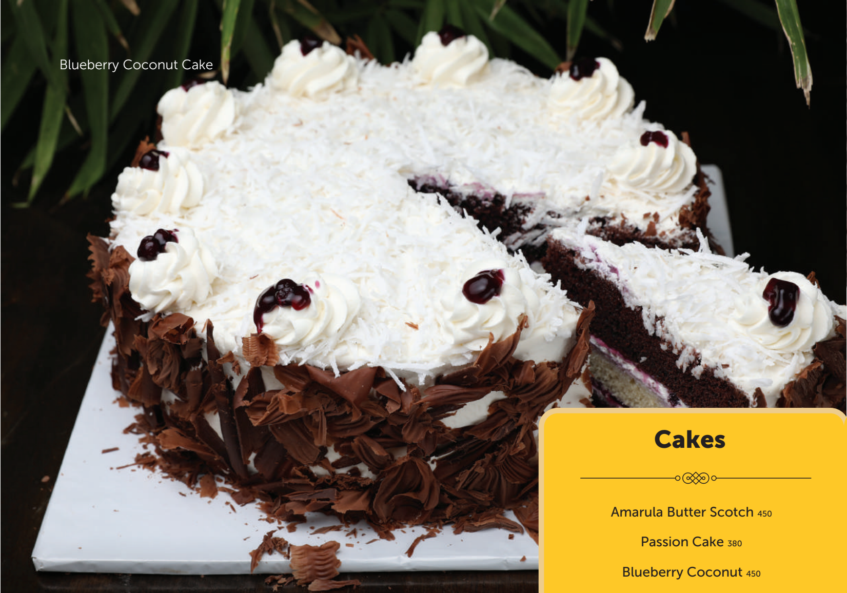
Blueberry Coconut Cake